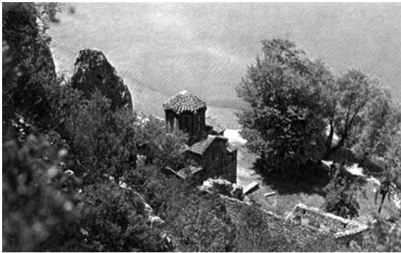
Monastery on Lake Ohrid.