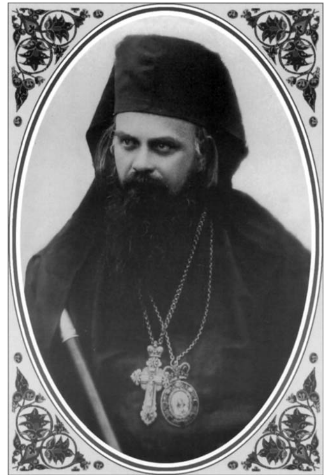
St. Nikolai Velimirović

Now available for the first time in English: The Complete and Unabridged PROLOGUE OF OHRID by St. Nikolai Velimirović