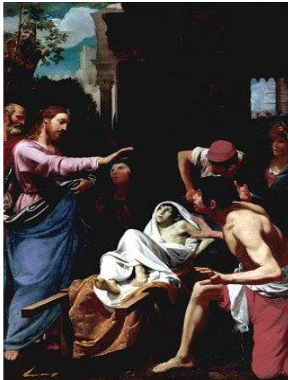
Christ Raising the Son of the Widow of Nain (Italy, 17 th century)

The true Gospel of Christ is taught by His true apostles, but how do we know the true ones? First, they are called by God, learning the Gospel by revelation ó directly from Christ or indirectly through apostolic tradition. Next, they form one Church -government,ø holding the same doctrine and working in council. Additionally, they stand firm in matters of conscience and are correctable when mistaken, always seeking to glorify God and not themselves.